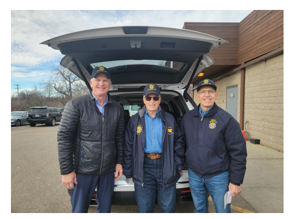
Post 501 members delivering Thanksgiving Day meals

Volunteering for a shift at Poppy Days offers you the opportunity to connect with your fellow veterans and interaction within the Woodbury community. I hope you can be a part of this important fund-raising event.