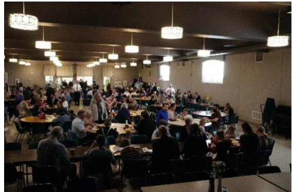
Parishioners enjoying brunch