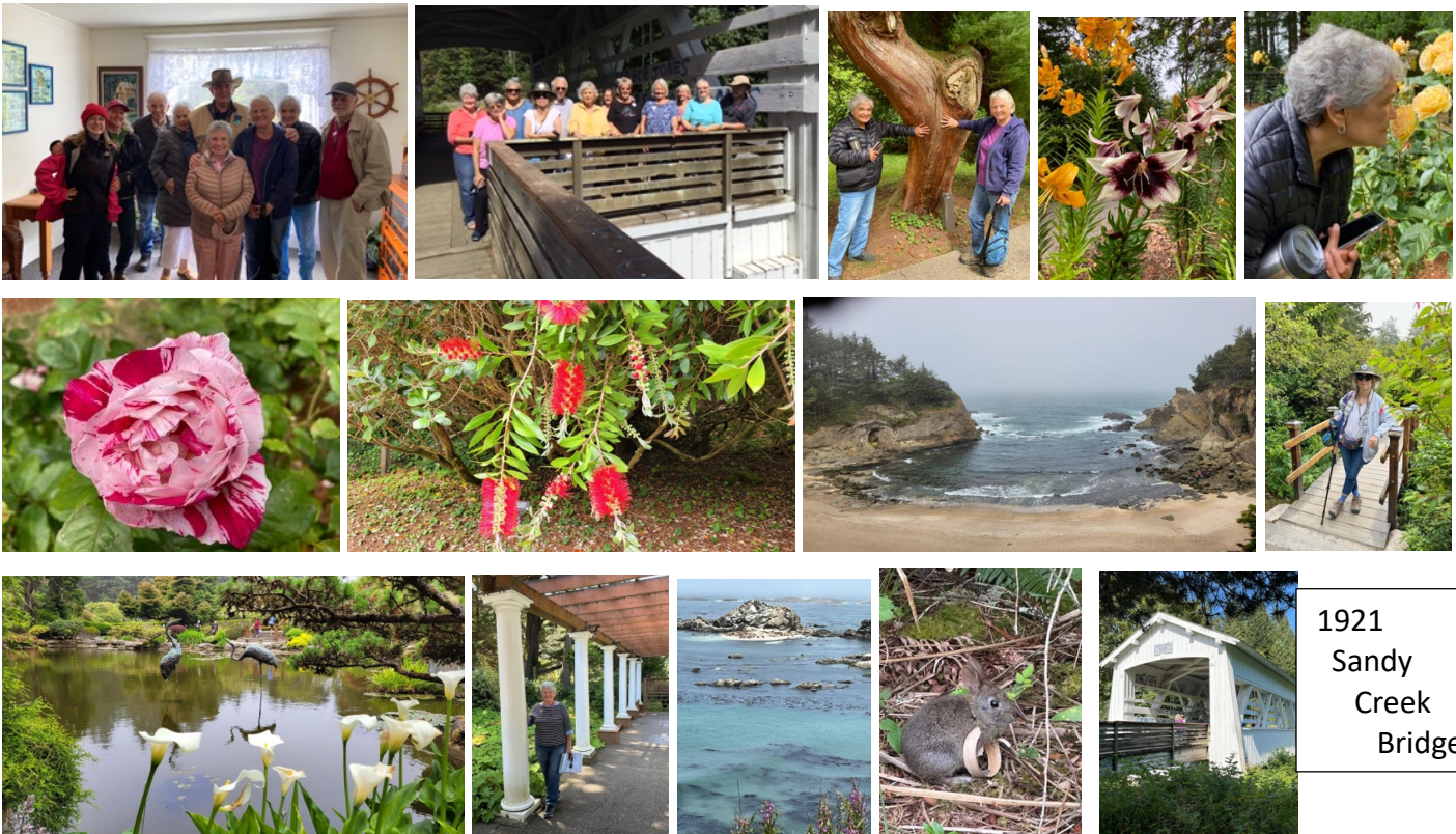
1921 Sandy Creek Bridge