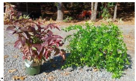
Riverside Park Gardens: