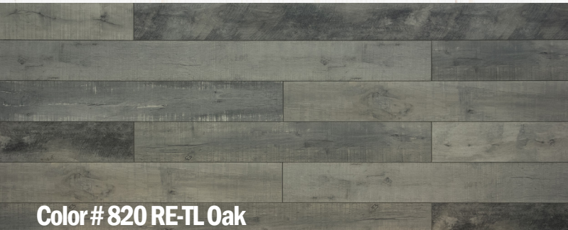
Color # 820 RE-TL Oak