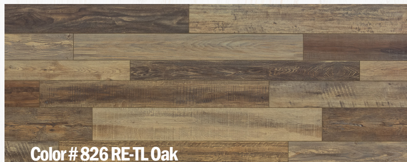
Color # 826 RE-TL Oak