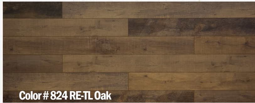
Color # 824 RE-TL Oak