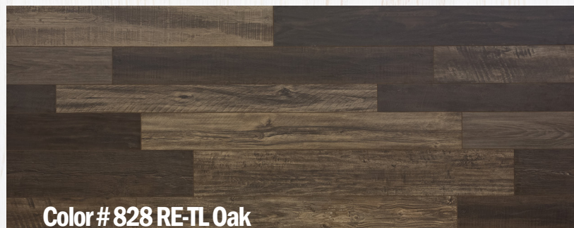
Color # 828 RE-TL Oak