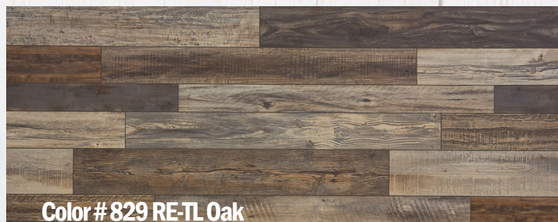
Color # 829 RE-TL Oak