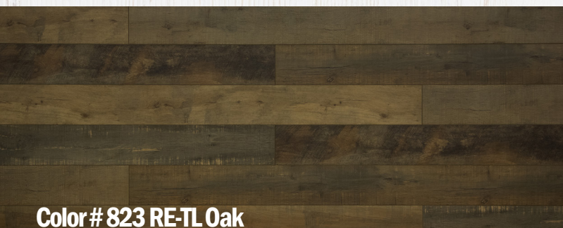
Color # 823 RE-TL Oak