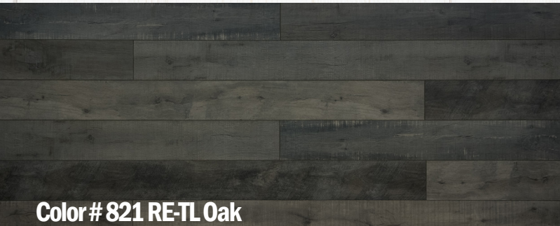
Color # 821 RE-TL Oak