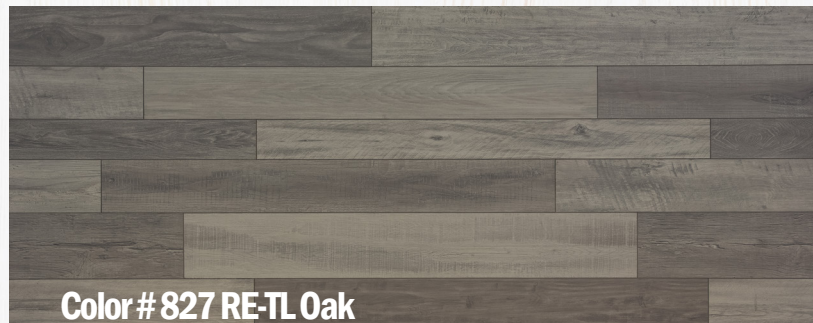
Color # 827 RE-TL Oak