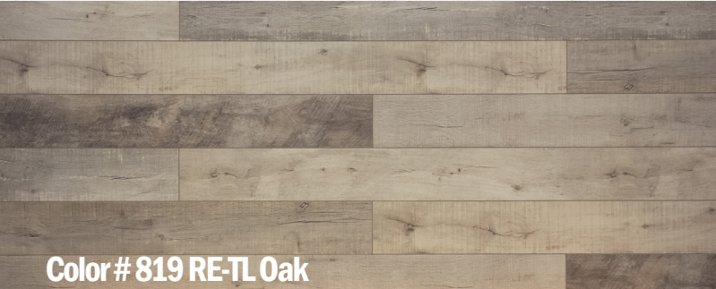
Color # 819 RE-TL Oak