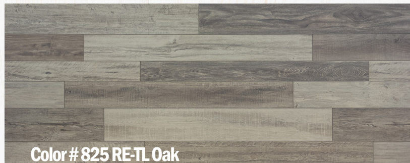
Color # 825 RE-TL Oak