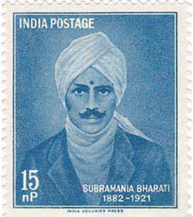
Subramanya Bharath 1960 Stamp

Subramanya Bharathi was a Tamil poet, reformer and freedom fighter during the pre-independence era. His used the adeptness at poetry to the best of his ability to coax the masses in the south to join the great Indian struggle for independence. Bharathi's name is counted amongst the