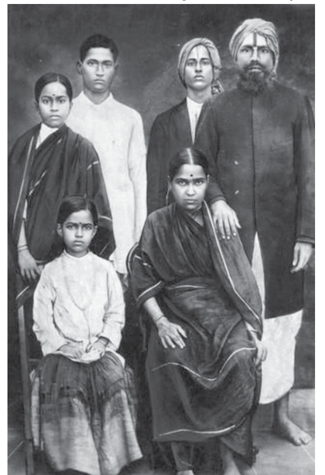
Subramanya Bharathi and his family

The exposure to political affairs led to his involvement in a faction of the Indian National Congress party that favoured armed resistance against the British Raj .