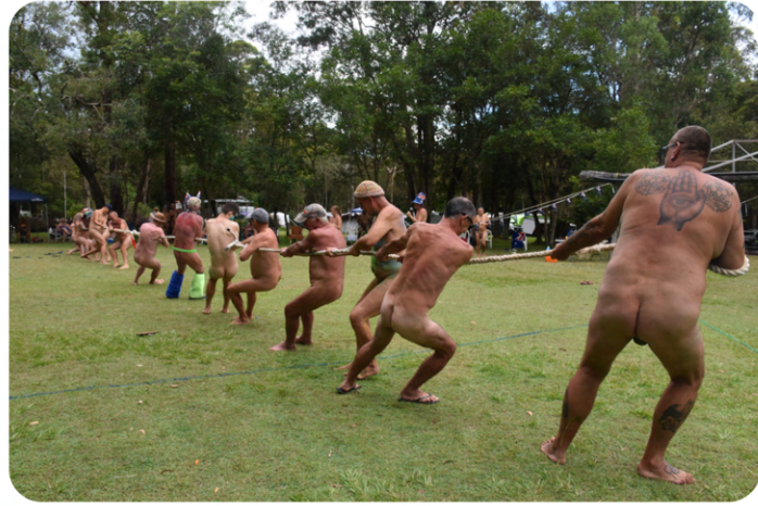
Tug-O-War at Australia Day 2023