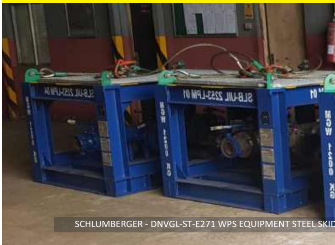
SCHLUMBERGER - DNVGL-ST-E271 WPS EQUIPMENT STEEL SKIDS