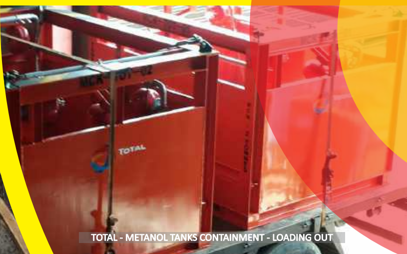
TOTAL - METANOL TANKS CONTAINMENT - LOADING OUT