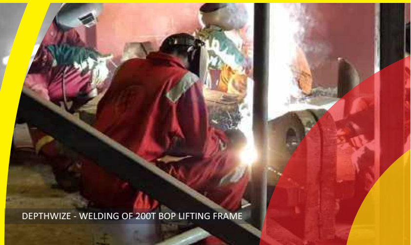
DEPTHWIZE - WELDING OF 200T BOP LIFTING FRAME