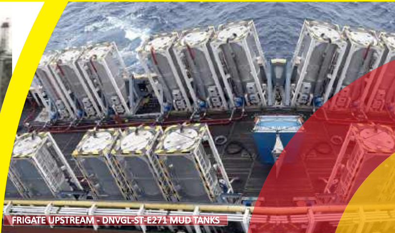
FRIGATE UPSTREAM - DNVGL-ST-E271 MUD TANKS