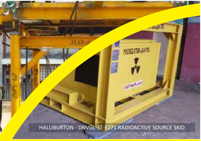
HALLIBURTON - DNVGL-ST-E271 RADIOACTIVE SOURCE SKID