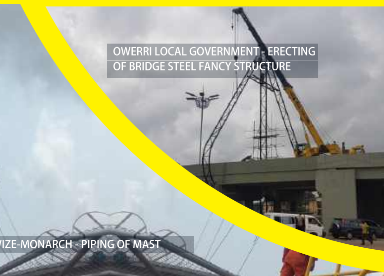
OWERRI LOCAL GOVERNMENT - ERECTING OF BRIDGE STEEL FANCY STRUCTURE