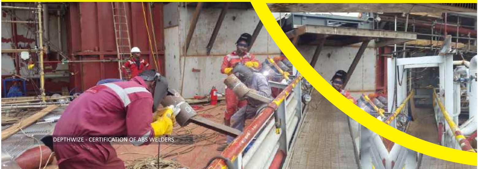
DEPTHWIZE - CERTIFICATION OF ABS WELDERS