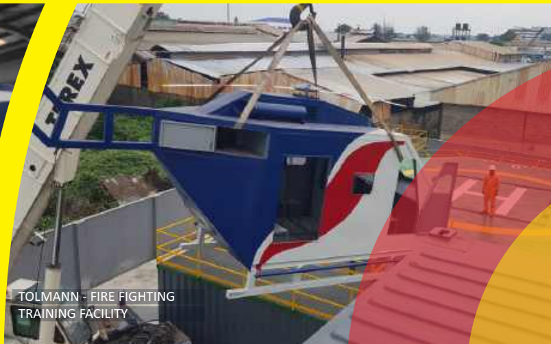
TOLMANN - FIRE FIGHTING TRAINING FACILITY