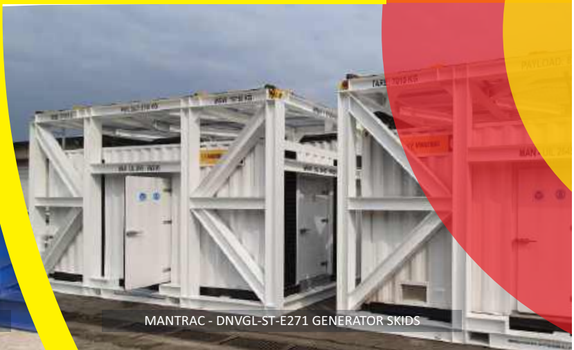
MANTRAC - DNVGL-ST-E271 GENERATOR SKIDS