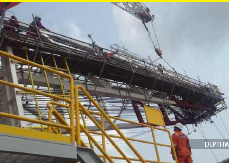
DEPTHWIZE-MONARCH - PIPING OF MAST