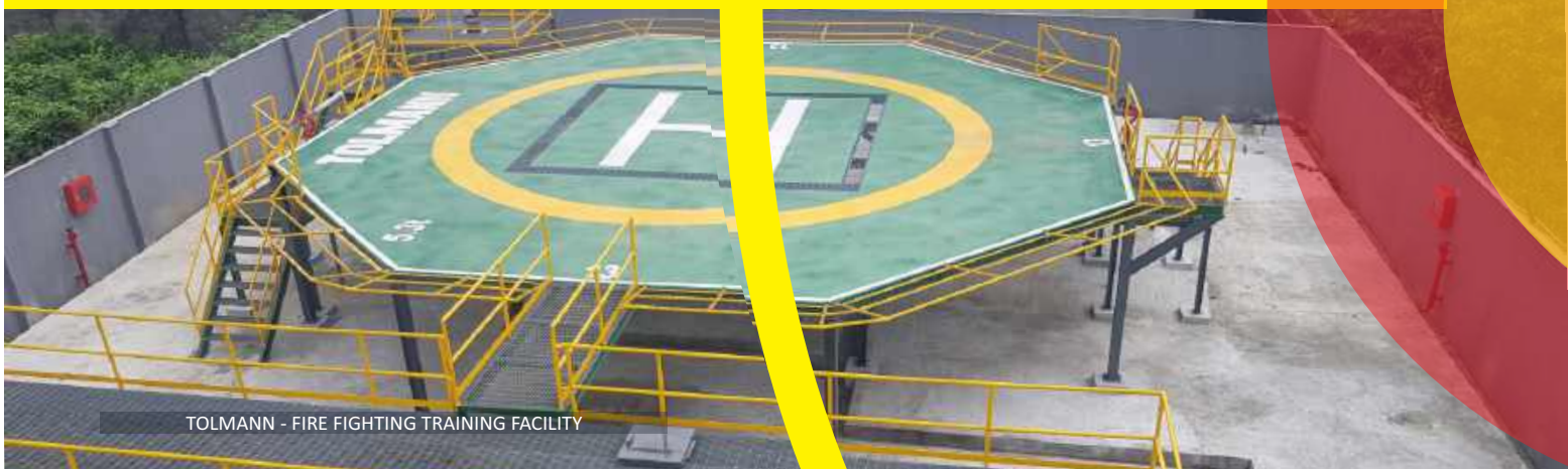
TOLMANN - FIRE FIGHTING TRAINING FACILITY