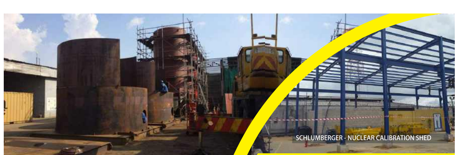
SCHLUMBERGER - NUCLEAR CALIBRATION SHED