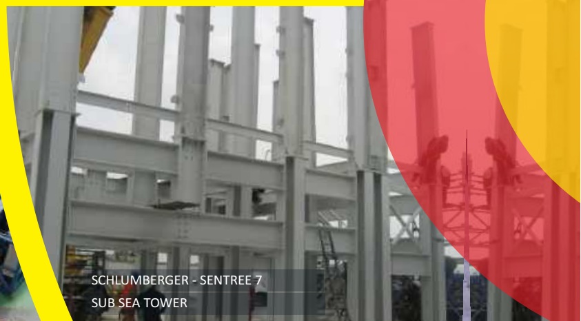
SCHLUMBERGER - SENTREE 7 SUB SEA TOWER