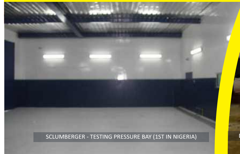
SCLUMBERGER - TESTING PRESSURE BAY (1ST IN NIGERIA)