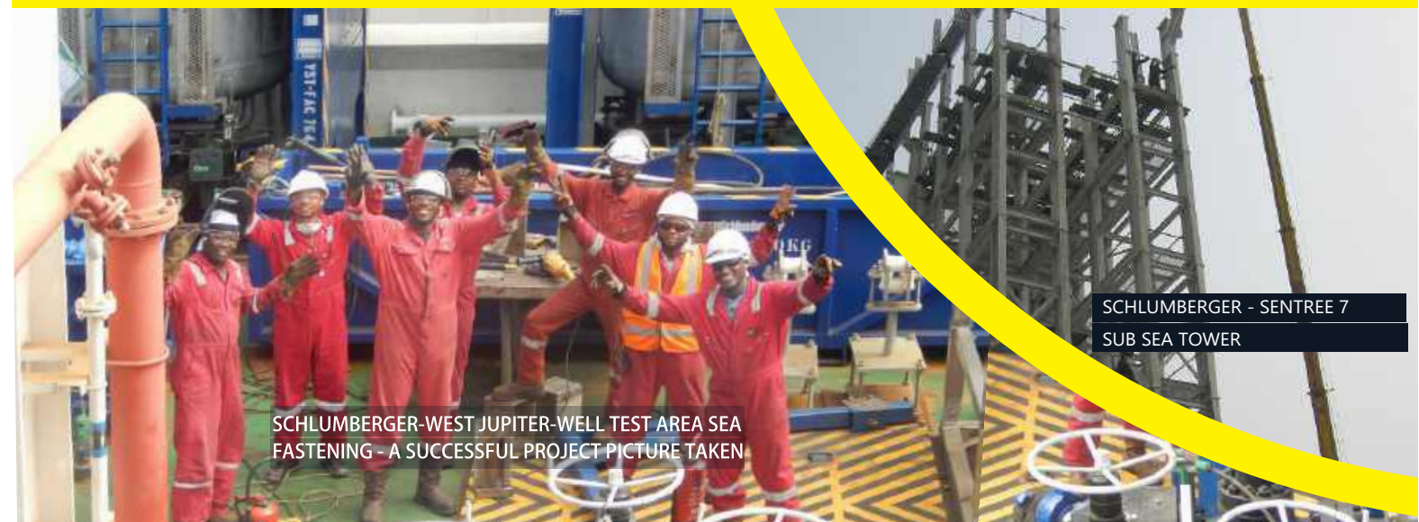
SCHLUMBERGER-WEST JUPITER-WELL TEST AREA SEA FASTENING - A SUCCESSFUL PROJECT PICTURE TAKEN