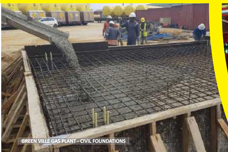
GREEN VILLE GAS PLANT - CIVIL FOUNDATIONS