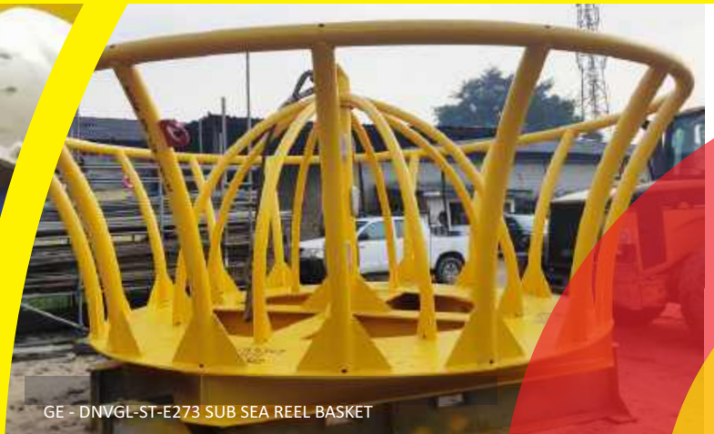
GE - DNVGL-ST-E273 SUB SEA REEL BASKET