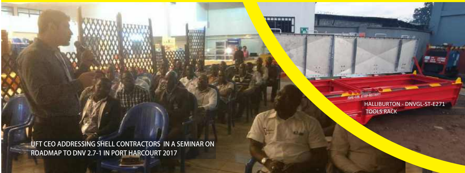
HALLIBURTON - DNVGL-ST-E271 TOOLS RACK