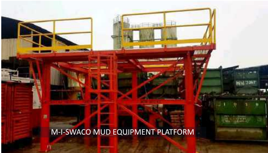
M-I-SWACO MUD EQUIPMENT PLATFORM