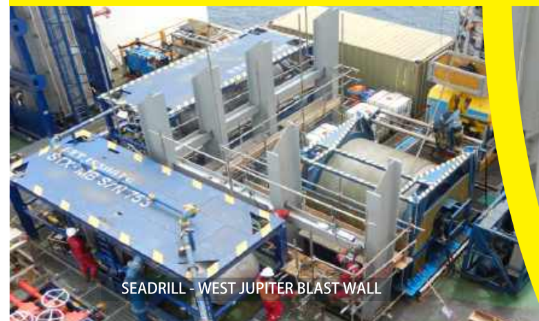
SEADRILL - WEST JUPITER BLAST WALL