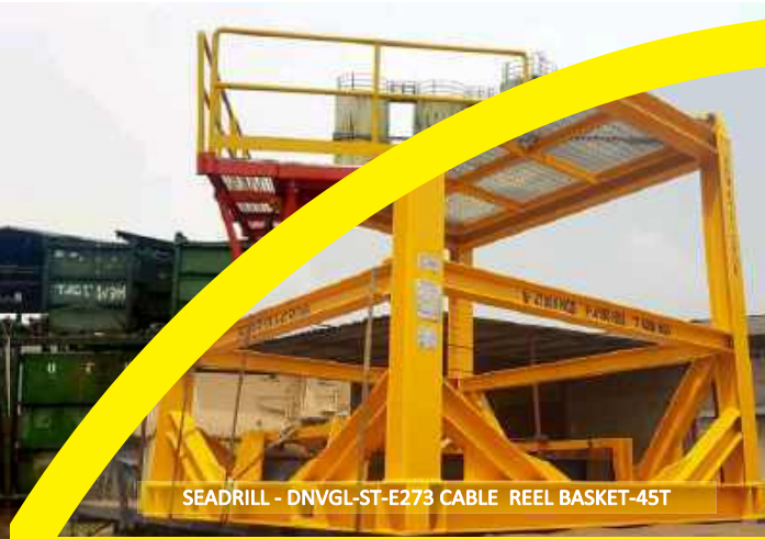
SEADRILL - DNVGL-ST-E273 CABLE REEL BASKET-45T