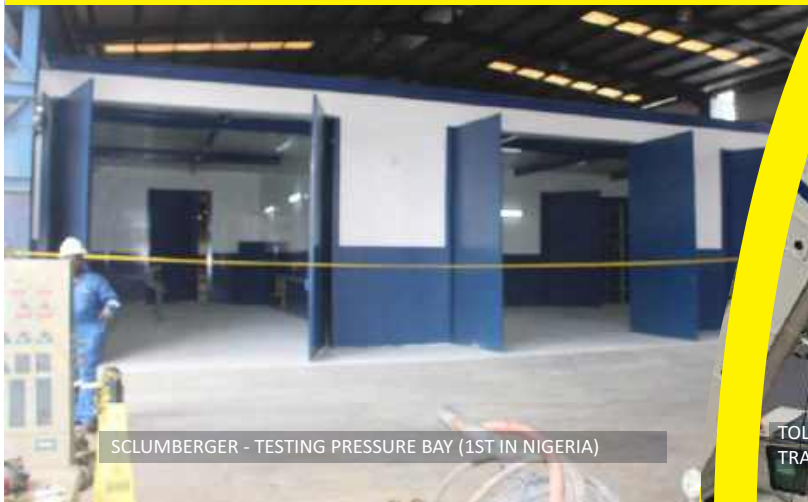
SCLUMBERGER - TESTING PRESSURE BAY (1ST IN NIGERIA)