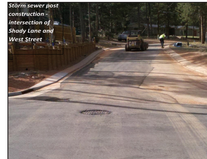
Storm sewer post construction - intersection of Shady Lane and West Street

Summary: The Shady Lane Storm Sewer project provided a critical storm sewer connection, allowing for development of a commercial parcel that was lacking a sufficient downstream drainage path and outlet. The downstream capacity was evaluated and used for the design of the storm sewer. The City, designer and contractor worked through a significant number of utility conflicts to successfully complete 1200 LF of storm sewer on schedule and within budget. ●