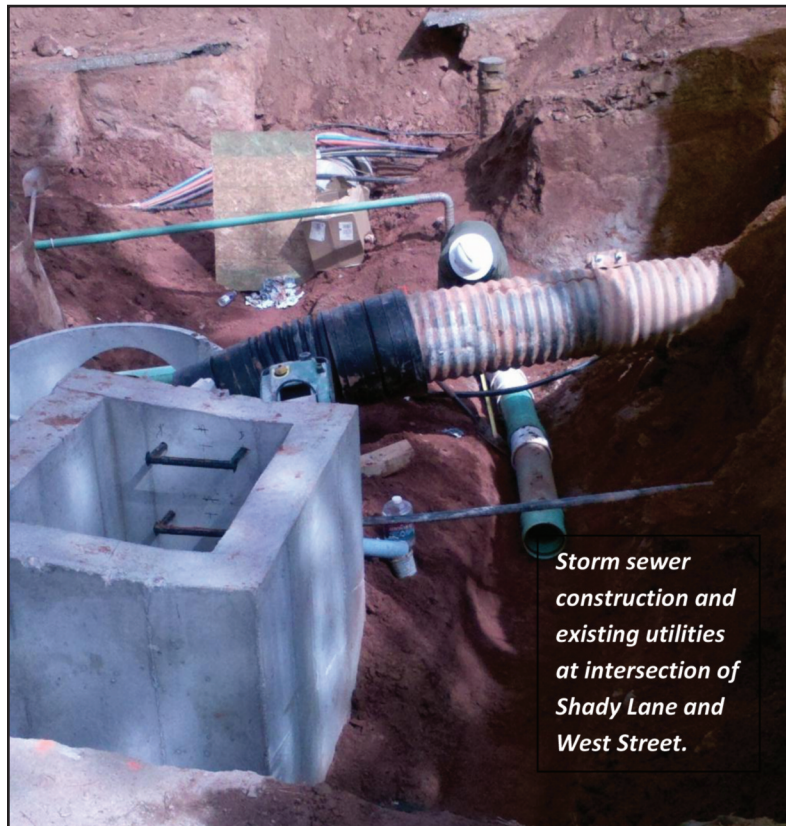
Storm sewer construction and existing utilities at intersection of Shady Lane and West Street.