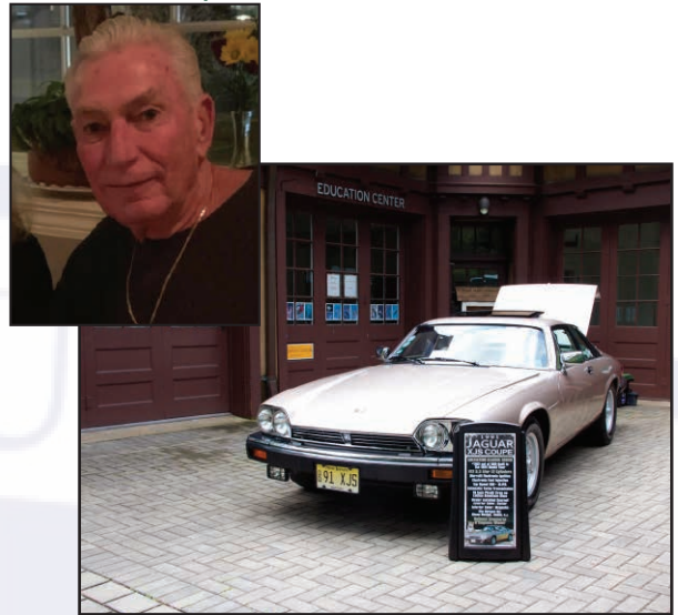
Long time member with show winning XJS