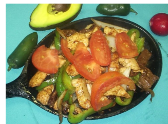
Beef & Chicken Fajitas

A sizzling pan of your choice of beef, chicken, or shrimp, with tomatoes, onions, and bell peppers. Includes your choice of soup or salad, with rice, refried beans, guacamole, and hot corn or flour tortillas.