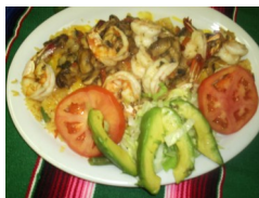
Shrimp with Rice

Shrimp with onions, mushrooms, lettuce, tomatoes, and a slice of pineapple with rice. Refried beans extra.