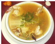
Caldo de Camaron