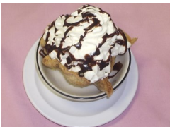
Deep Fried Ice Cream