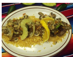
Banderilla de Beef