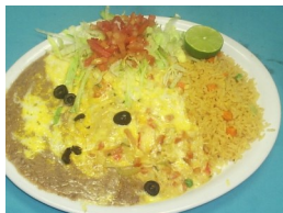
Enchiladas de Camaron