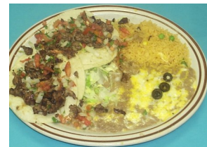
Tacos de Asada