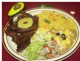
Carne al Pastor