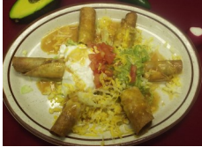
Taquito Basket Taquito Basket (3)