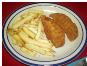
Junior Chicken Fingers

Children 10 years old and under only. No exceptions.