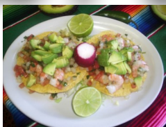
Tostadas de Ceviche