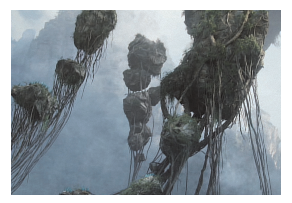
Figure 4 The floating mountains of Pandora (James Cameron, Avatar)

In Avatar, however, this linguistic and visual analogy is not only repeated but pushed to a new level by the effective employment of 3D filming technology. This technique visually enhances the representation of the Pandora jungle as a three-dimensional space that resembles the spatiality of an actual brain as a three-dimensional object: the kind of object the viewers have seen in the holographic projections of brains and neural pathways at the beginning of the film. The potential of these new cinematic possibilities is fully and spectacularly played out when Augustine's research team explores the 'legendary floating mountains' of Pandora by helicopter. Consisting of huge rocks and lumps of earth suspended in mid-air and connected by lianas and other plants, these 'floating mountains' visually resemble clusters of neurons (ganglions) and give a new dimension to the spatial experience of Pandora as a giant brain (Fig. 4).<sup>79</sup> The spectacular flight scenes and nose dives of the camera eye in Avatar therefore are more than just effective means of an action film to create thrill and excitement, they have an epistemological dimension as well: they visually superimpose neuronal and planetary spaces and thus contribute to the film's attempt to show the microscopic in the global and the giant in the small.