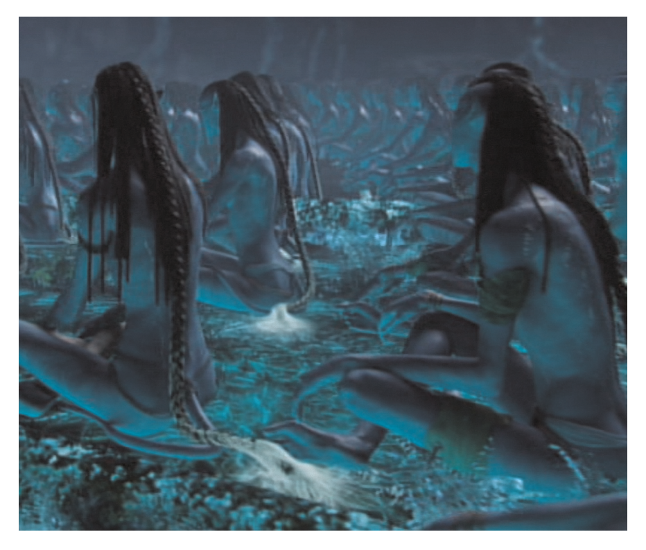
Figure 2 Gathering at the Tree of Souls (James Cameron, Avatar)