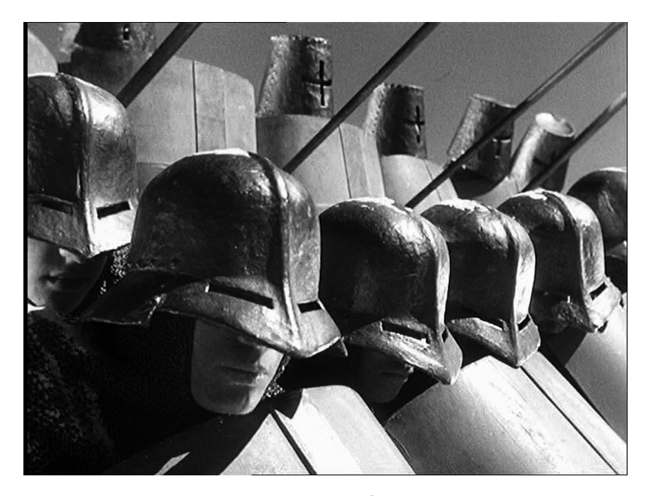
Figure 1 Sergei Eisenstein, Alexander Nevsky (1938)

neurons and synapses to the meso-level of individual brains and the macro-level of social interaction, Avatar and Het gebied van Nevski perform their own versions of the neuromolecular gaze. They thereby employ what I suggest to call a poetics of the neuromolecular gaze, i.e. representational and associative strategies that suggest a natural continuity between the cellular, the cerebral and the social. In this way they participate in what has been called the 'seductive allure'5 that contemporary neuroscience exerts on the popular imagination by suggestive and reductionist forms of reasoning that claim direct relations between social processes, mental states and their alleged 'neural correlates'. These strategies certainly call for discursive analysis and ideological critique; they do not, however, necessarily lead to a homogenous and hegemonic neuro world-view, as some critics of the present 'neuro-hype' fear. Avatar and Het gebied van Nevski are cases in point: because they use different tropes to 'scale up' from the neuronal to the social – the Darwinian trope of the 'brain as a battlefield' and the connectionist trope of the 'brain as a network' – they also project quite different visions of what a 'neuromolecular' view of personal identity and social relations could mean.