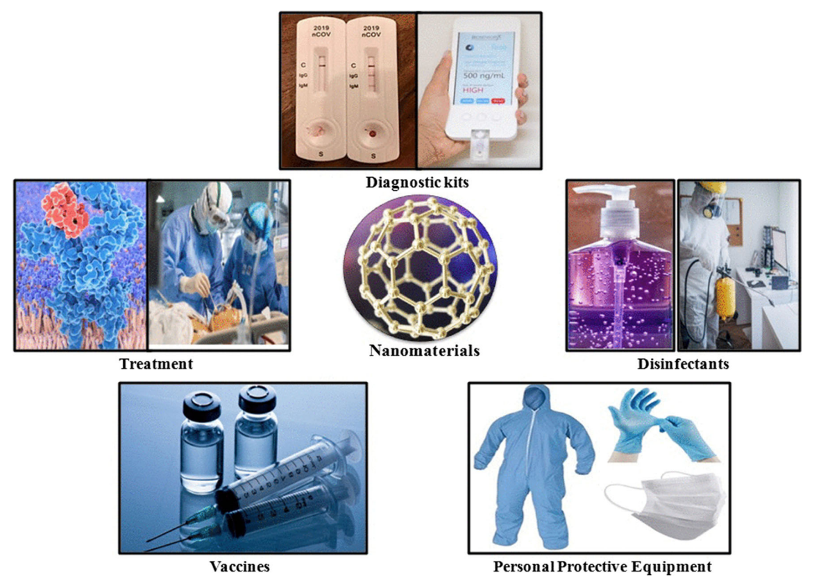
Fig. 2 Applications of nanomaterials

DNA/RNA/protein from blood, stool, serum, and nasopharyngeal swabs. The rapid diagnostic test (RDT) requires 30 min to analyze the samples for interpreting the results. RDT is widely used in the detection of various infections and considered as point-of-care (POC) test. Earlier, RDTs are used for detection of Rotavirus, Adenovirus, Escherichia coli, Salmonella , Plasmodium , and other pathogens.