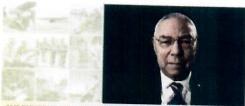
#DESERTSTORM30: A 'FABULOUS' JOB

#VetResources is a weekly newsletter for Veterans, their Families, Caregivers, and Survivors. SIGN UP | VIEW/SHARE | EVENTS | WELCOME KIT | PODCAST