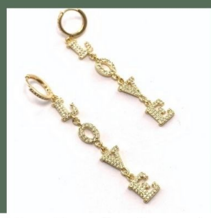
Hot Rocks Jewels