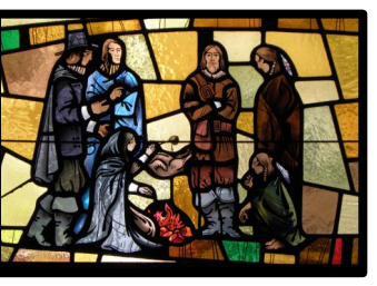
7: "The First Thanksgiving"