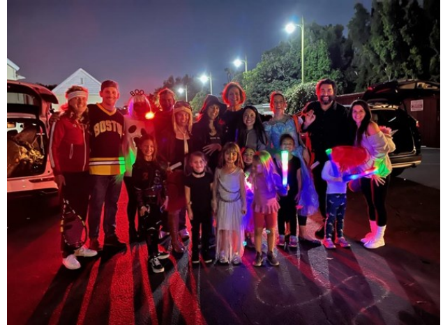
Alums participating in Trunk or Treat festivities...

Upcoming events for the Preschoolers in November include Pilgrim's Vittles in Bower Hall at 5pm for the entire family preceding the long Thanksgiving weekend.