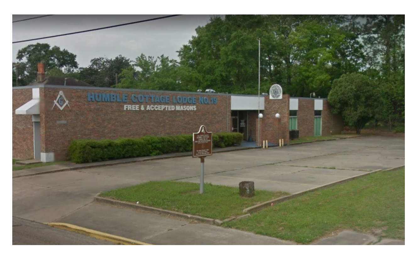
324 South Main Street, Opelousas, LA