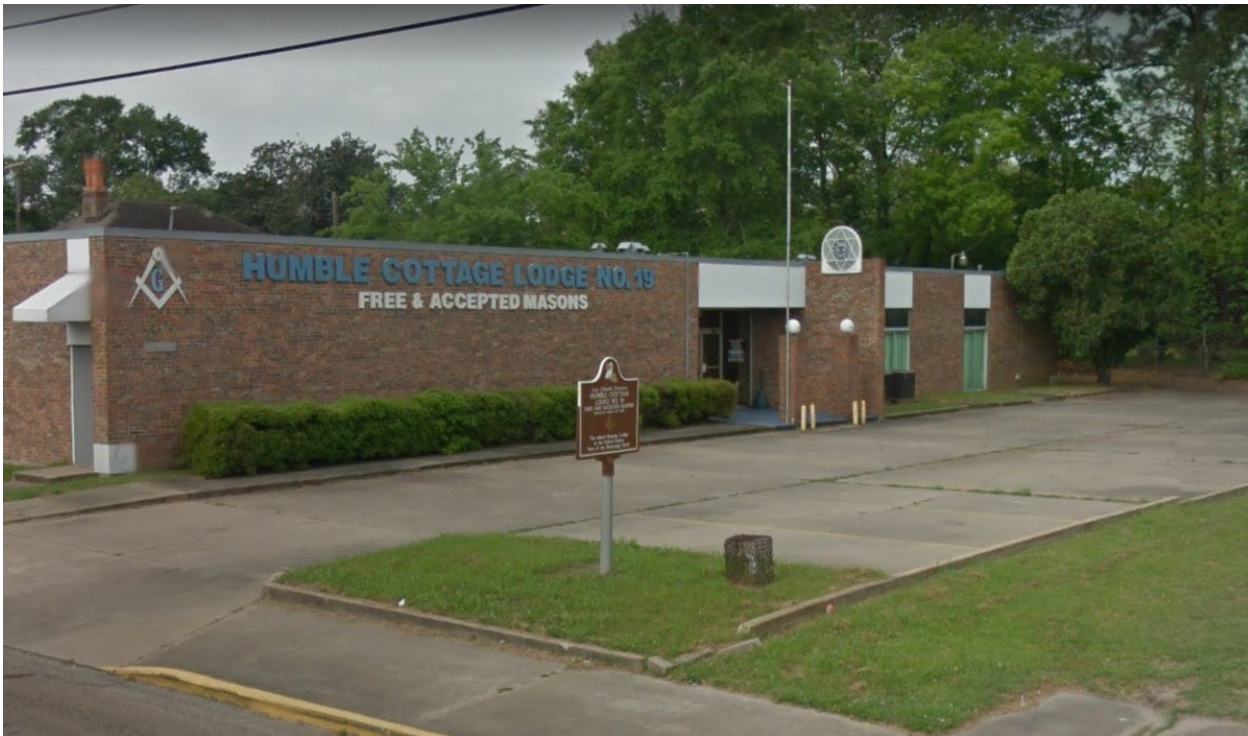
324 South Main Street, Opelousas, LA