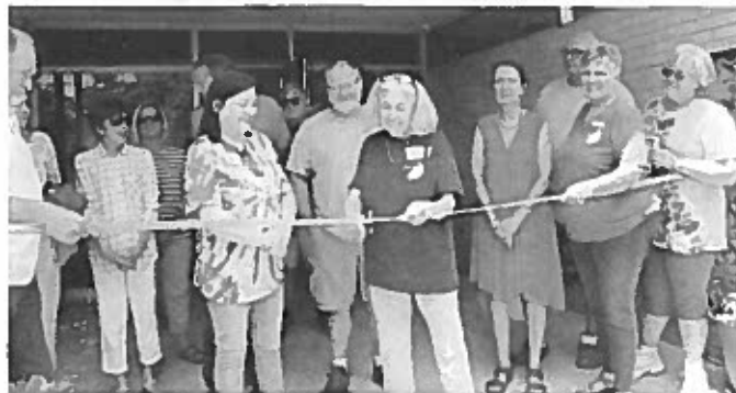
Ribbon cutting ceremony

It was one of the best in large part because at long last, (after more than 40 years) we have a home of our own! Over all these years, our “stuff” has been stored in volunteers’ homes! We initially thought we would build a 2,800 square foot building, putting an end to the need to transport animals for our spay/neuter clinic and allowing us to bring the pet food pantry indoors, no longer having to use tents, regardless of weather. For so long, we have persevered, opening the pantry where the temperature was 25 or 95 degrees, in rain, sleet and even snow.