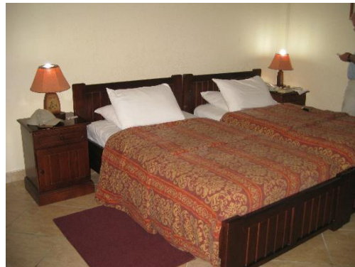
Coconut Grove Regency Hotel-Accra

DAY-4 Sunday: Accra/Kumasi-Ashanti Region. Early breakfast and departure for Kumasi, check in to hotel, city tour (Yaa Asantewaa, Weaving Village), shopping, historical overview of Ashanti History, Culture/Golden Stool, legacy, Adinkra, Separation/Transition ( forced march from interior to coast/making of a slave ), dinner. De-brief/Sharing, retire. Journal Entry # 4.