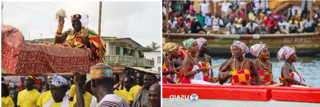
Batakue Festival – Elmina

DAY-9 Friday: Elmina: 4 AM Elmina Sunrise Ceremony (Incorporation) . Return Coconut Grove, shower, Breakfast, Komenda beach luncheon, sharing, Return Coconut Grove, last night. Journal Entry #9.