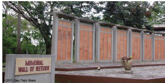
Memorial Wall of Return-Assin Manso