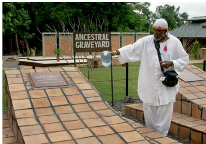
Ancestral Graveyard-Assin Manso