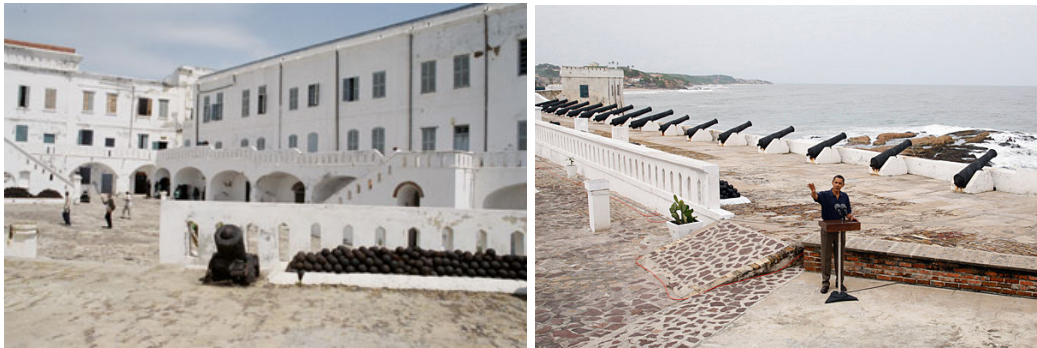
Cape Coast Slave Castle – On the right is President Obama on his visit in 2009

DAY-5 Monday: Kumasi/Elmina-Central Region. Early breakfast, checkout, complete Kumasi sites/activities/visit to Asantehene's Palace, etc., Proceed to Central Region, lunch en-route (nice beachfront location (if possible). Transition - Assin Manso (making of slave cont'd/ritual), Asebu Visit, Check into hotel, dinner. Retire (transfer guests participating with Atonkwa family hosts. Orientation at Atonkwa Palace). Journal Entry # 5.