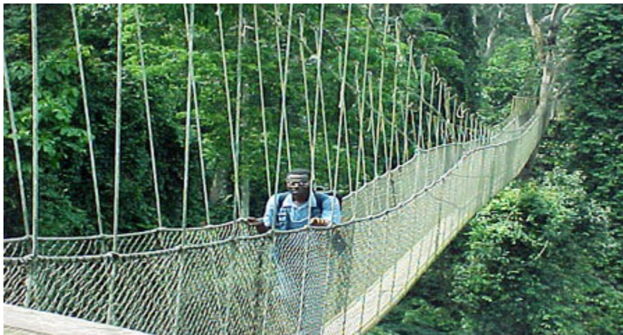
Kakum Rain Forest Park

2 nd pmt. Feb. 15 $507.00 3 rd Pmt. Mar. 15. $507.00 4 th pmt. Apr. 15. $507.00 5 th pmt. May. 15 $507.00 6 th pmt. Jun. 15. $507.00 7 th Pmt. Jul. 15. $507.00 8 th pmt. Aug. 15 $507.00 Final pmt. Sep. 15. $567.00