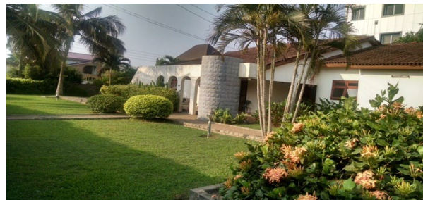
Private Home – Accra (Farewell Dinner)

DAY-11 Sunday: Accra/Washington- Final shopping, collect any custom orders, packing, relaxing, departure for overnight return flight. South African Airways flight 209 at 11:35pm.