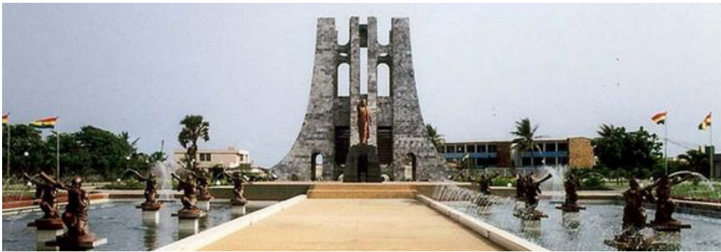
Kwame Nkrumah Mausoleum - Accra