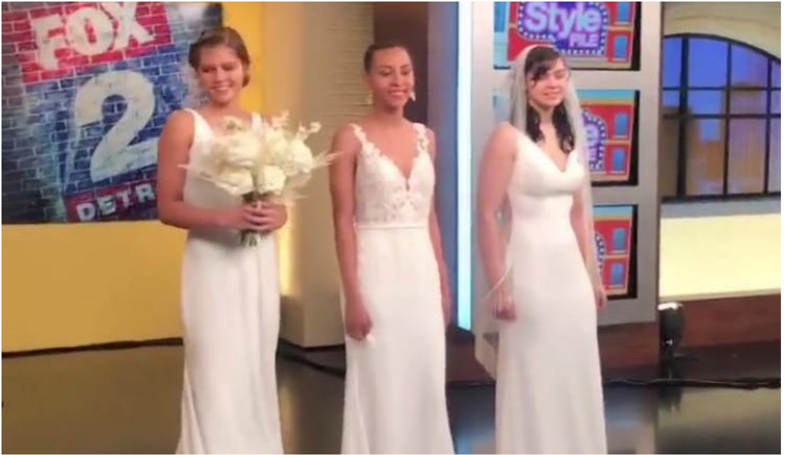
MTM MODELS DETROIT

The MTM Agency is a division of the John Casablancas Modeling and Career Center and performs all the duties of a professional Talent Agency.