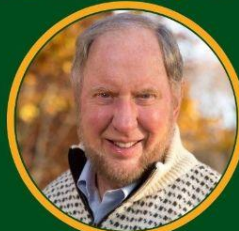
AWARDEE Robert Putnam, Author of Bowling Alone & Co-Author of The Upswing-How We Came Together a Century Ago and How We Can Do it Again