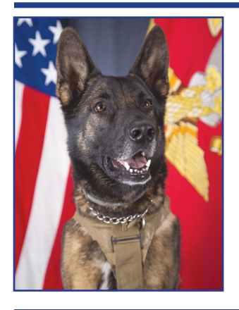
War footage courtesy of Marking History Channel.

U.S. Navy SEAL, Afghanistan, Belgian Malinois - In 2011, Cairo took part in "Operation Neptune Spear," the raid that eliminated Osama bin Laden in Pakistan. Cairo provided perimeter security during the raid, searching for bombs and escape tunnels. After all clear, they went inside the building. During his tours, Cairo was shot twice in the line-of-duty, recovered, and continued serving.