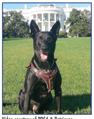
Video courtesy of PDSA & Retriever.