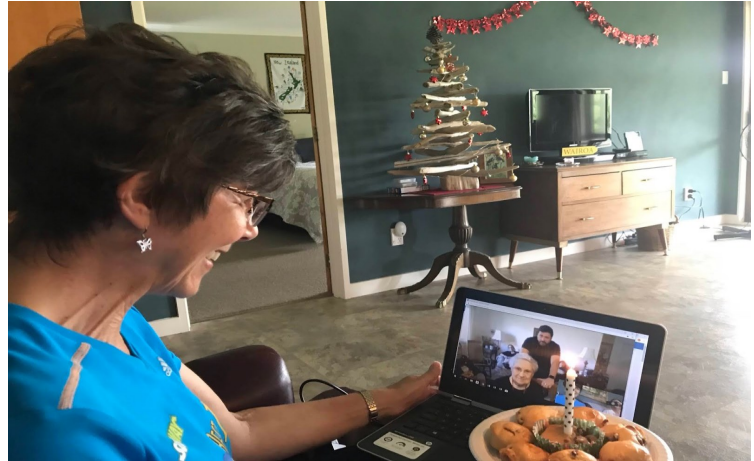
We are never so far away that love cannot reach us.

“Go into all the world and preach the gospel to every creature.”