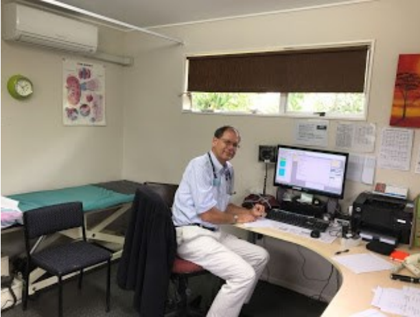
A Doctor's work is never done!