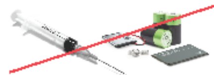
NO Batteries or Needles in the Recycling or Trash Batteries and needles pose safety risks for our employees. Check for local drop-off programs for proper disposal NO arrojes pilas o agujas en el reciclaje o la basura Las pilas y las agujas presentan riesgos de salud para nuestros empleados. Puede visitar los programas locales de entrega para su disposición adecuada.

© 2018 WM Intellectual Property Holdings, LLC. The Recycle Often, Recycle Right® recycling education program was developed based upon national best practices. Please consult your local municipality for their acceptable materials and additional details of local programs, which may differ slightly.