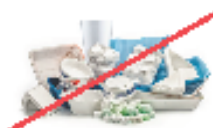
NO Foam Cups & Containers NO vasos y recipientes de poliestireno