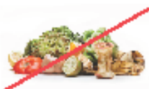
NO Food or Liquids NO comida o líquidos

NO incluya en su contenedor de reciclaje mixto: