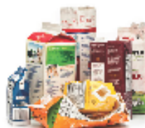
Food & Beverage Cartons Cartones de alimentos y bebidas