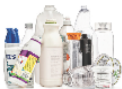
Plastic Bottles & Containers Botellas y envases de plástico