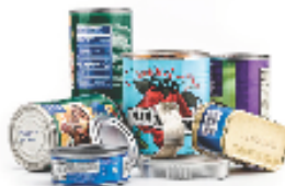
Food & Beverage Cans Latas de alimentos y bebidas