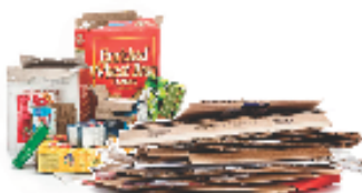
Flattened Cardboard & Paperboard Cartón y cartulina aplastados