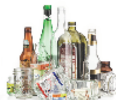
Glass Bottles & Containers Botellas y frascos de vidrio

Do NOT include in your mixed recycling cart: