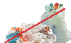
NO Loose Plastic Bags, Film or Bagged Recyclables Empty recyclables directly into your cart NO bolsas y envolturas de plástico sueltas, o materiales reciclables embolsados Vací directamente los materiales reciclables en nuestro carrito