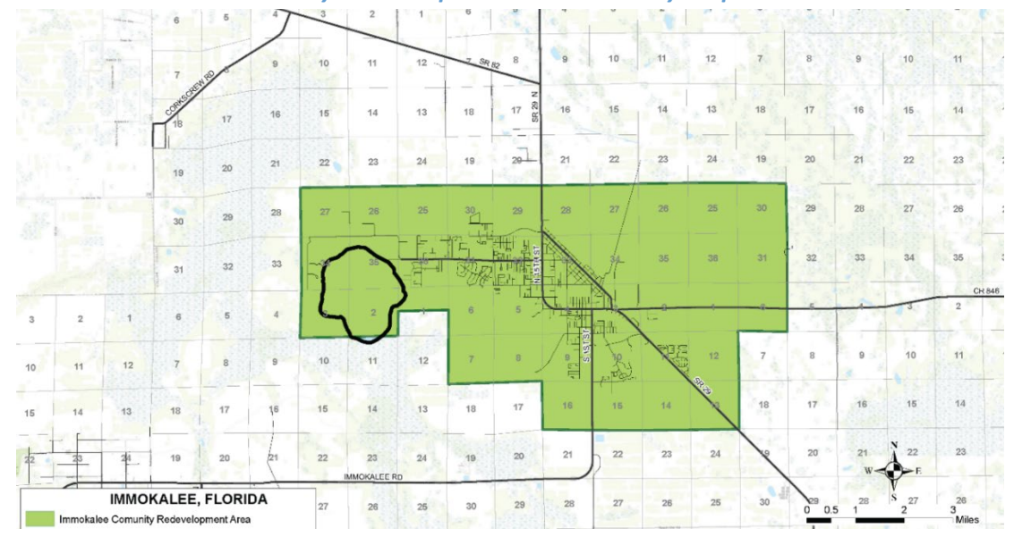
Figure 4-1 - Immokalee Community Redevelopment Area Boundary Map

The 2022 Immokalee Redevelopment Plan provides an updated vision and approach to redevelopment of the Immokalee Community Redevelopment Area (ICRA), depicted in Figure 4-1 below.