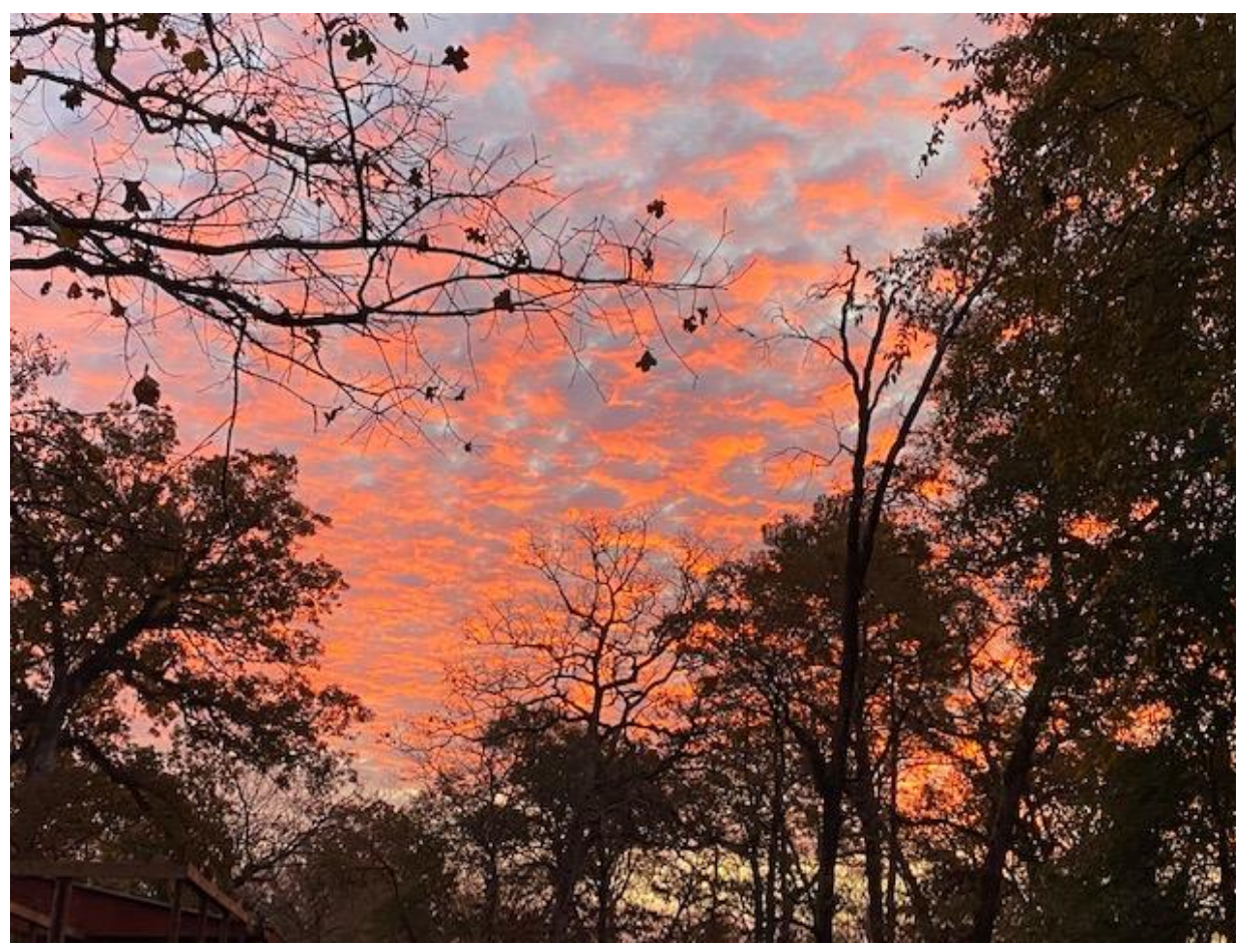
Another beautiful sunset picture in Lakeside Village