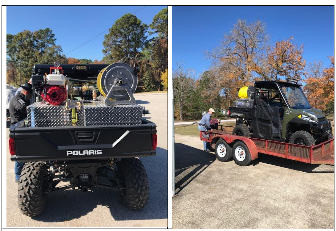
980 North VFD has worked hard over the past few years to save up donations in order for the purchase of this new brush buggy. This apparatus is essential to fighting ground fires.