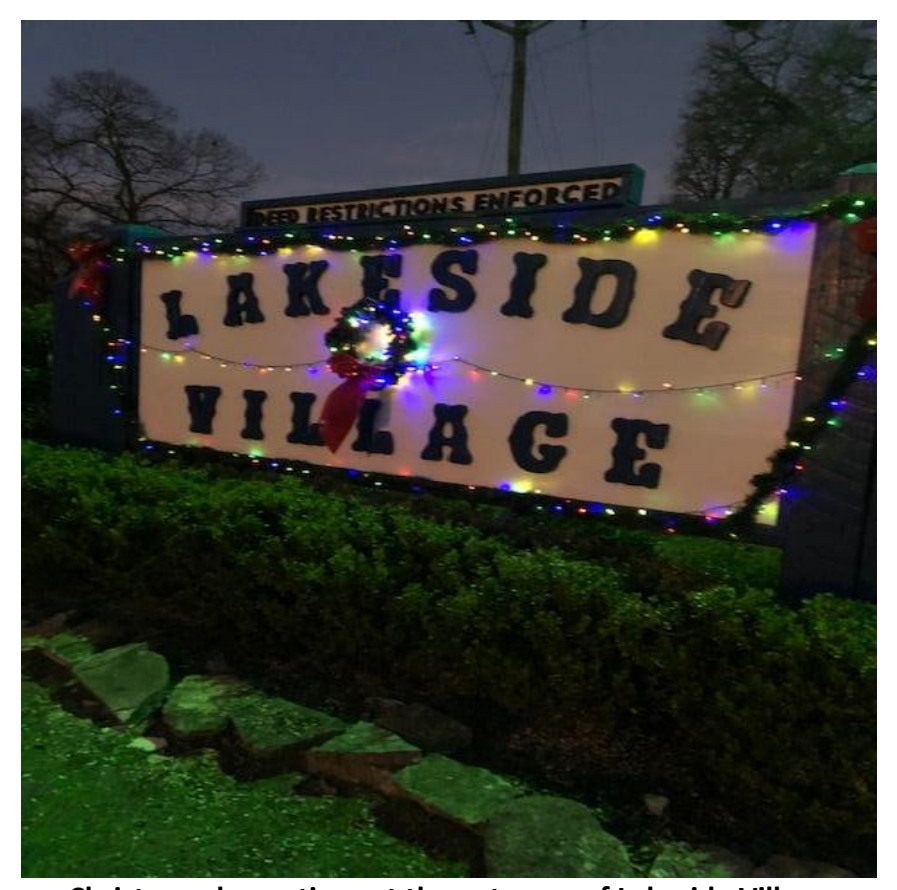
Christmas decorations at the entrance of Lakeside Village