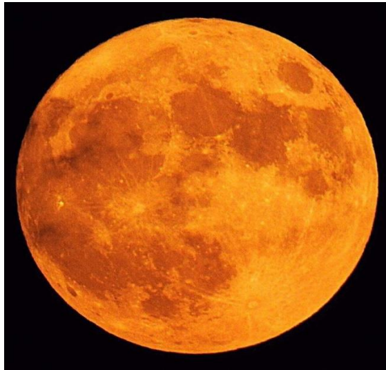
HARVEST MOON (borrowed from Facebook)