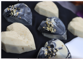
Mini choc hearts