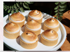
Mini lemon meringue