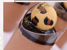
Mousse cups with macaron