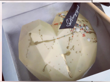
Choc smash hearts