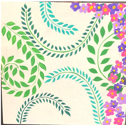
Top: Collage with magazine photos Bottom: Collaboration w/ other G32 art attendees