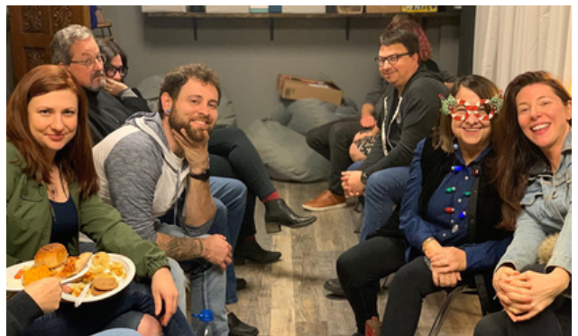
Throw back to our Friendsgiving potluck last November! 24 people, 13 stories about gratitude, homemade food, and tons of laughter. Need a safe place to go during the holidays? Join us.

COME VISIT US IN PERSON OR GIVE US A CALL