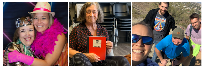
Another spoof Glamour Shots event might be coming around the corner. Trish published her first book while attending writing groups. When the weather cools, we'll start up our hikes again!