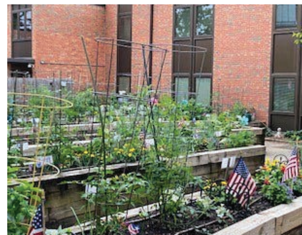
Below: The DuPage Care Center works to fund otherwise unfunded quality of life programs and activities, including this resident's garden club, and many other programs that help residents do as much as they can, as well as they can, for as long as they can. The DPCC Foundation is hosting their annual Golf Outing fundraiser on June 28th – see page 8 to golf for a good cause!