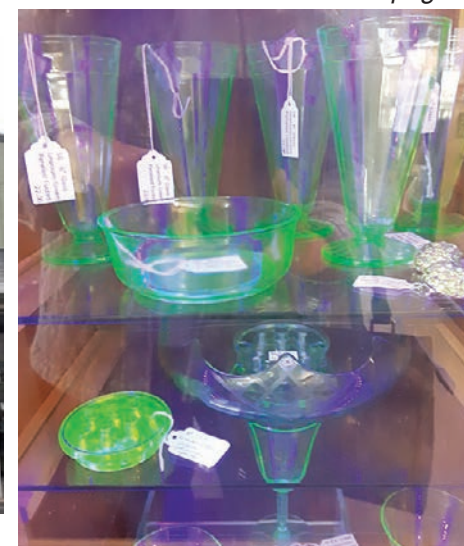
Left to right: Antiques of Winfield, Uranium Glass.