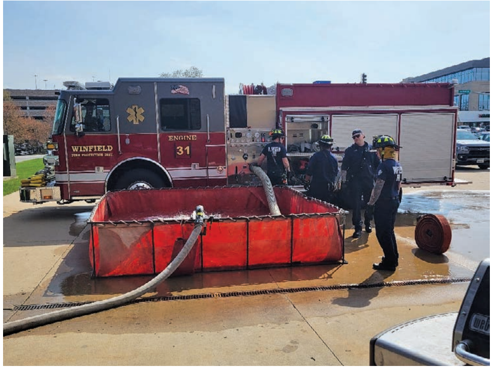
Nice spring weather allowed firefighters to practice using the new Engine 31. They also took the opportunity to train new crew members how to operate the engine.

During the warm sunny weather the week of April 15, firefighters took the opportunity to practice using their new equipment and train the newer crew members how to operate their first fire engine.