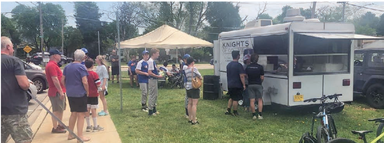
Left: The KOC Snack Shack opens June 1st, grilling hamburgers, cheeseburgers, sausages, hot dogs, and serving cold drinks! See page 2 for more details, and savor summer!

While ESSER funds aided some of our success, we credit our academic recovery success to the staff, students and parents who demonstrated resilience, hard work and unwavering commitment to our learning acceleration efforts the last few years. We look forward to continued academic excellence as we work together to inspire, educate, challenge and support all students to reach their highest level of learning and personal development.