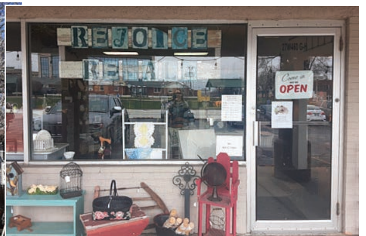
Clockwise from top left: Antiques & Chic, Rejoice Resale Shop entrance and interior.