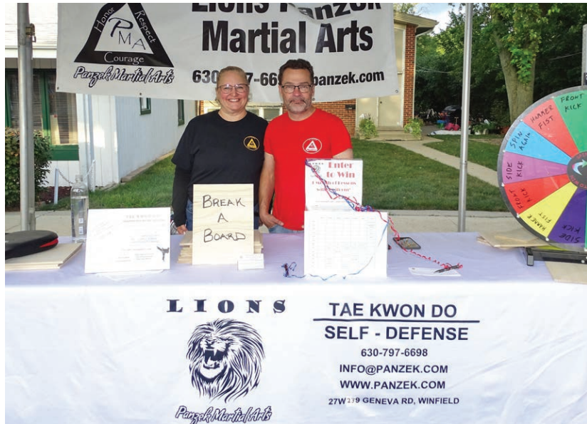
Left: Lion's Panzek Martial Arts participated in the Good Old Days Farmer's Market.

Today, I will change my "Early-Winter Melancholy" to a celebration of hope – giving to others because I am fortunate enough to have so much, honoring lost friends and family through charity, and counting blessings and reliving joy and laughter of the past year as I work through each task of preparing for the change of season. I will find a way to be better this year as I go into this winter – and for me that is always a struggle – by opening my eyes to the beauty and bounty heaped on us each and every day – right here, in our tiny little village of Winfield. I could not ask for more. May your coming days be full of blessings, your holidays full of joyous laughter, magic, sparkle, and warm memories to carry you through the winter.