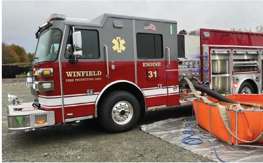
Winfield Fire Protection District's new Engine 31 has completed the manufacturing and testing process at Sutphen Fire Apparatus in Ohio. It will be fitted with tools and equipment and crews will spend two weeks training on it before it will be put into service in late November.

Our new fire engine was delivered to the dealer in Shorewood the first week of November! It is now being upfitted with the tools and equipment it will carry and our firefighters will spend two weeks training with it to become familiar with all its features and pumping controls. This engine replaces our 2008 model, which will move to the South station as a backup truck for the days our new engine goes out for service. We expect the new fire engine to be in service in late November, so be on the lookout!