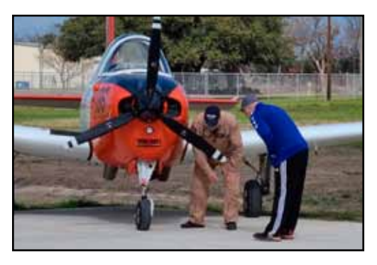
New Coyote Squadron Colonel Ray Mix getting ready to ride with Colonel Dan Summerall