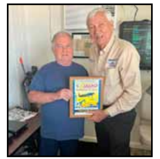
Sunset Cove Marina