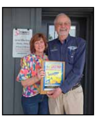
Stewart Insurance Agency