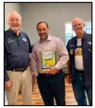
Blackwell & Presley