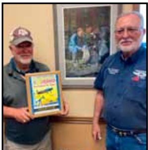
Prairie Pet Food