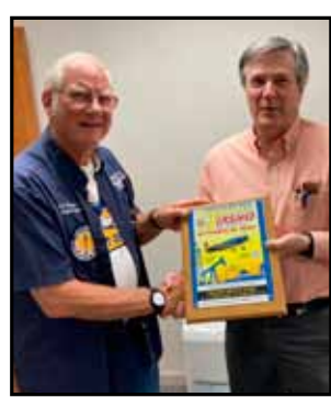
Watkins Development Company