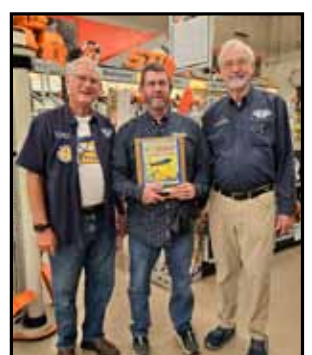
Gilfillan's Paint and Hardware