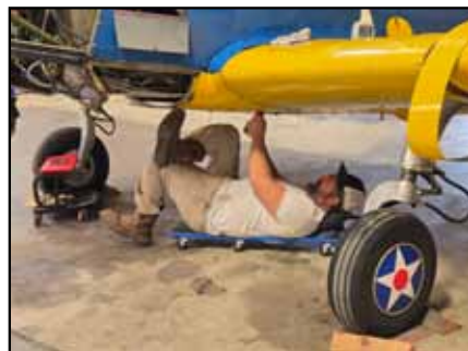
Colonel Cozart begins to remove panels for the PT-19 annual.