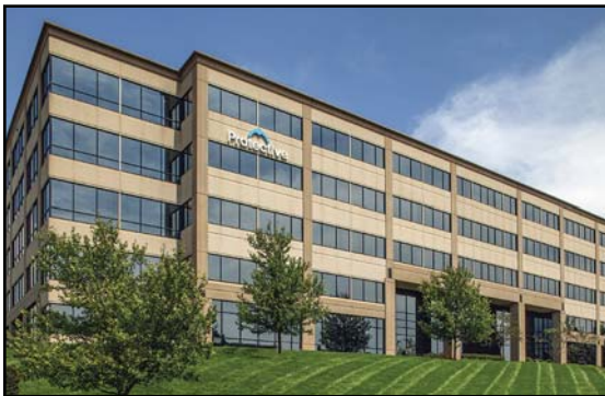
One Chesterfield Place 14755 N. Outer Forty Road Chesterfield, MO 63017