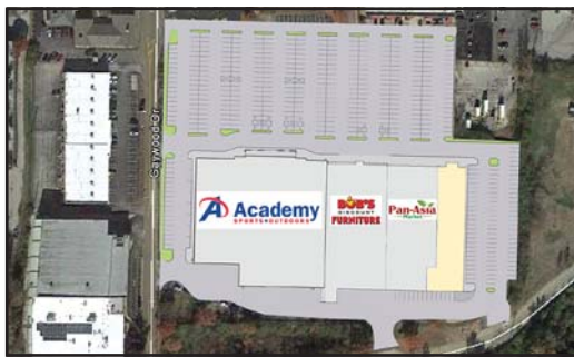
Manchester Plaza 14244 Manchester Road