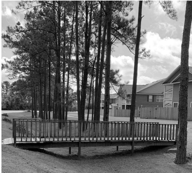
Guste Island Bridge