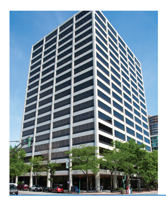
One Rotary Center in Evanston, Illinois, USA

Rotary International is administered by the Secretariat, which comprises the general secretary and nearly 800 employees who work to support clubs and districts around the world. Rotary's world headquarters is in Evanston, Illinois, USA, in a building called One Rotary Center. It includes a 190-seat auditorium, Rotary's archives, and an executive suite with conference rooms for the RI Board of Directors and Rotary Foundation Trustees and the offices of the