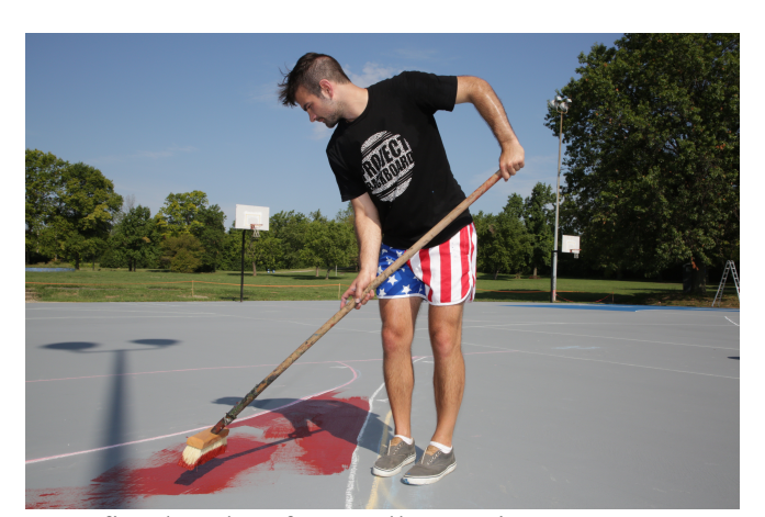
Use roofing brushes for smaller sections