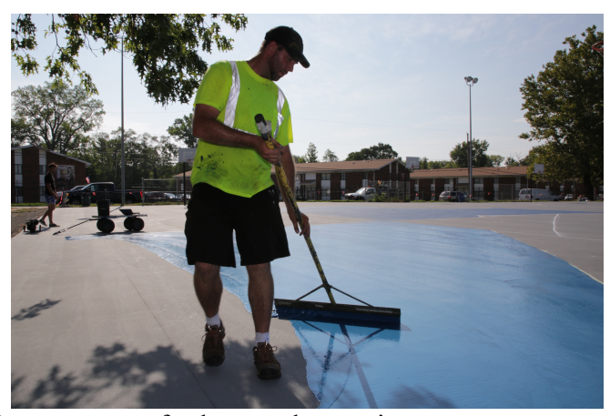
Use squeegees for large color sections