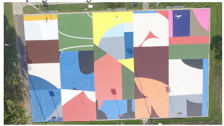
Completed court art pre-lines.