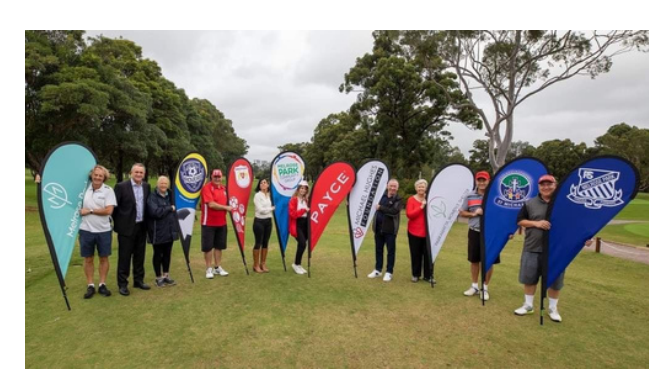
Figure 3. The lucky community groups partaking in the Melrose Park Community Cup Golf Day & Dinner funded by PAYCE Foundation and organised by Brooks Community Consulting.

We also loved the support of the Melrose Park Community Cup Golf Day and Dinner, with staff and Board members getting really involved in organising this terrific fundraising event.