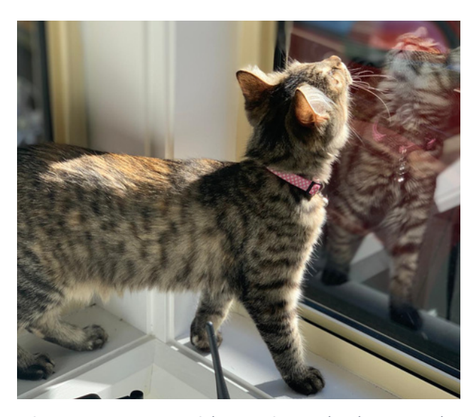
Figure 1. New resident Kitten looks out the window of her home at our Shelter, thanks to the Department of Communities and Justice DFV PAWS Grant

thanks to a Domestic and Family Violence Pets and Animal Welfare Support (DFV PAWS) Grant from the NSW Government Department of Communities and Justice.