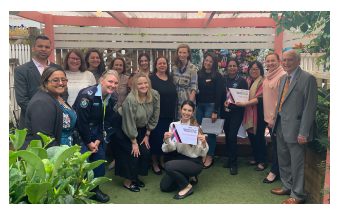
Figure 4. Celebration Brekky following the end of the Virtual Walk-A-Thon organised by Parramatta Cumberland Family and Domestic Violence Prevention Committee.

The virtual walkathon organised by the Parramatta Cumberland Family and Violence Domestic Prevention Committee far exceeded its fundraising target and the celebration brekky afterwards was a wonderful highlight too.