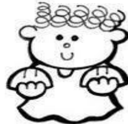
THOSE WHO LOVE JUSTICE

INSTRUCTIONS: Cut a large circle (7" diameter) on yellow construction paper in the shape of a sun. Cut around the above pictures in a circular shape. Color the pictures and glue onto the yellow circle.