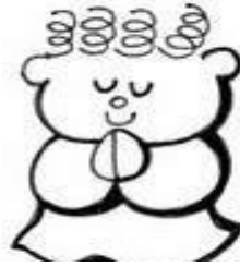
THE POOR IN SPIRIT