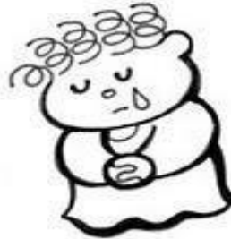
THOSE WHO MOURN