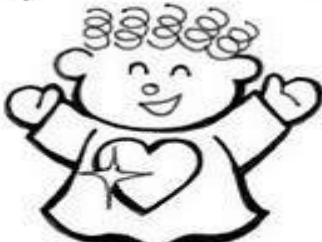
THE CLEAN HEARTED