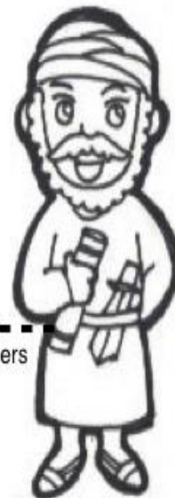
Judas (Jude, Thaddaeus, Lebbaeus)