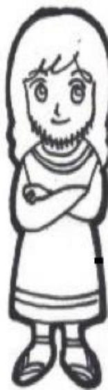
James (Son of Alphaeus)