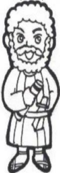
Simon (The Zealot)