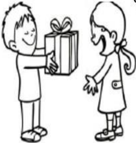
OBEYING THE WORD OF GOD