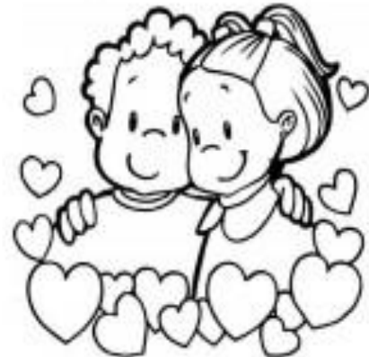
Love of Neighbor