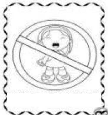
Control Negative Emotions