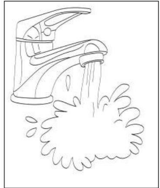
AGUA – cleans & gives life