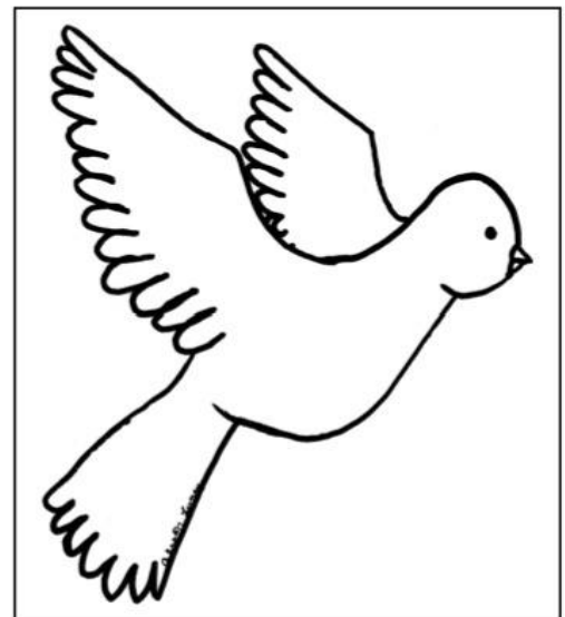
DOVE-represents peace and purity