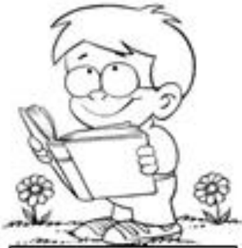
In the Bible