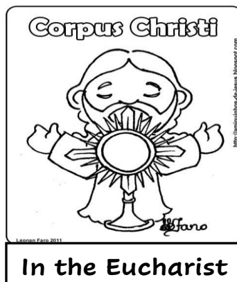
In the Eucharist