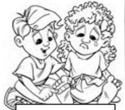
In my brothers