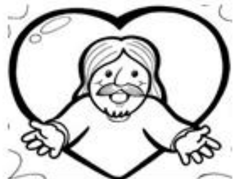
In my heart