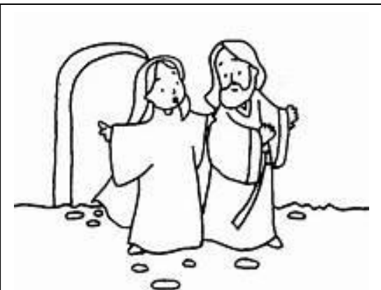
"They have no wine!"