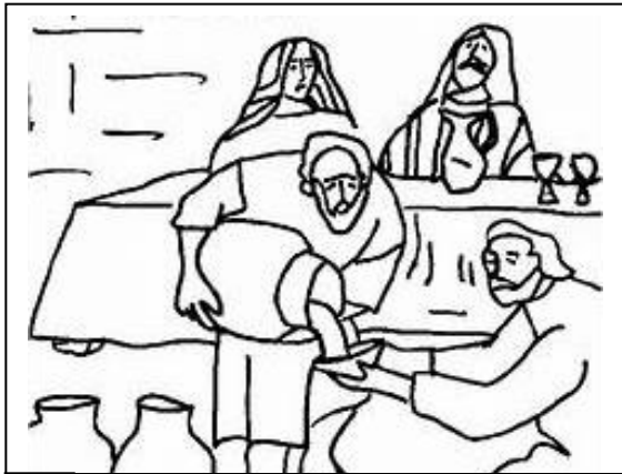
"Fill the jars with water"