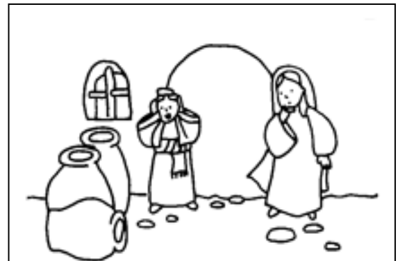
The wine ran out!