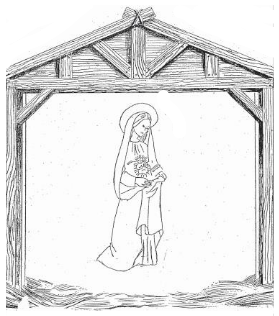
THE VIRGIN MARY Jesus was conceived by the Holy Spirit in the womb of Mary. She cared for Him with much love.