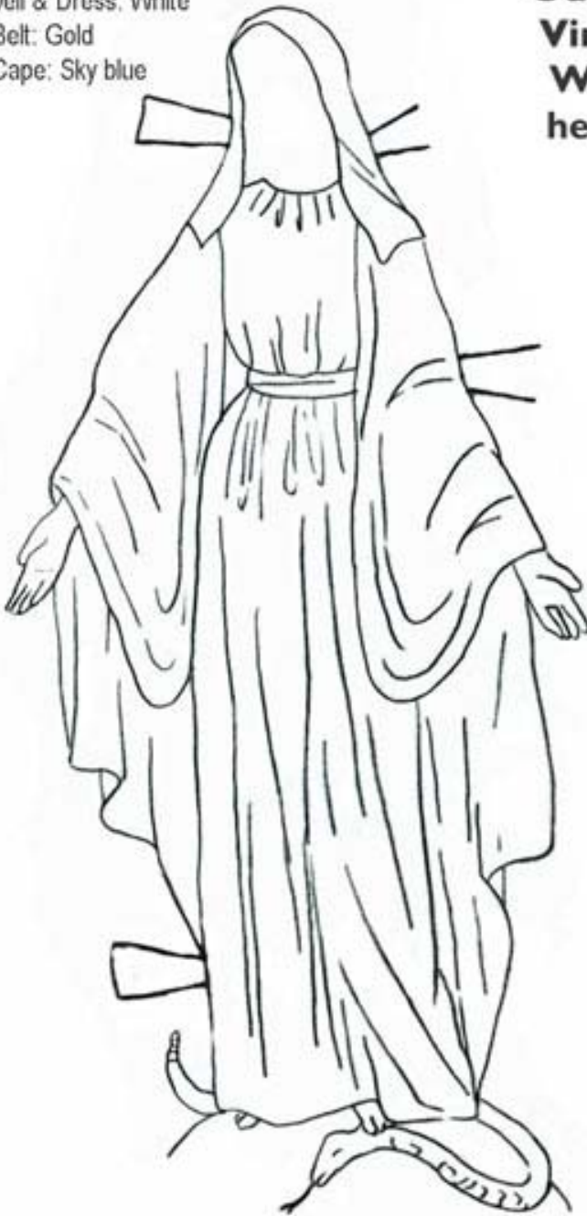
Our Lady of Grace Veil & Dress: White Belt: Gold Cape: Sky blue

Our Mother, the Blessed Virgin Mary, is only one. Would you like to dress her with the advocacy you like the most.